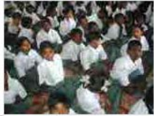
Children of an East Bengaluru School in their new uniforms donated by RNRI.