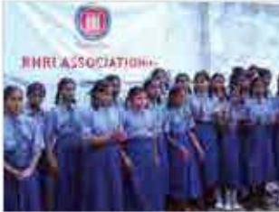
School uniforms distribution at a school in West Bengaluru.