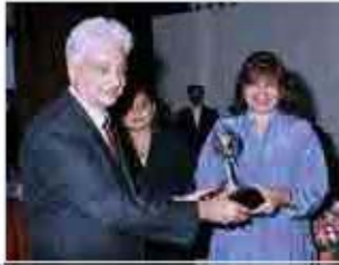
Kiran Mazumdar Shaw and Azim Premji

The RNRI families engrossed in a cultural program