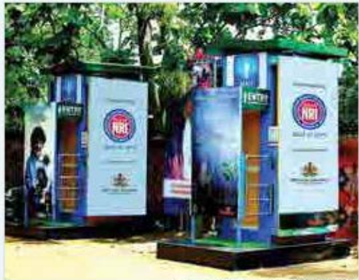
Swachh Bharat Public Toilet

Under the “Back to Serve” initiative, education and healthcare have been the key areas of focus. This year, the Association will be undertaking projects that will help in improving the quality of life and also provide primary needs such as clean surroundings and sanitation. The problems arising due to lack of proper sanitation and provisions for appropriate waste management are real and need urgent attention. Increased awareness will bring about a change in attitudes, social values, and public behaviour.