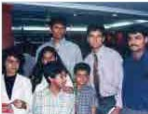
Star cricketers in a RNRI meeting.