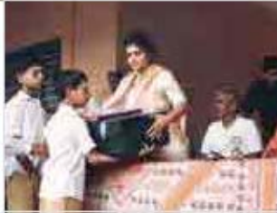
RNRI donating the basics required for the orphans near Kanakapura.